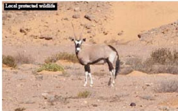
Local protected wildlife