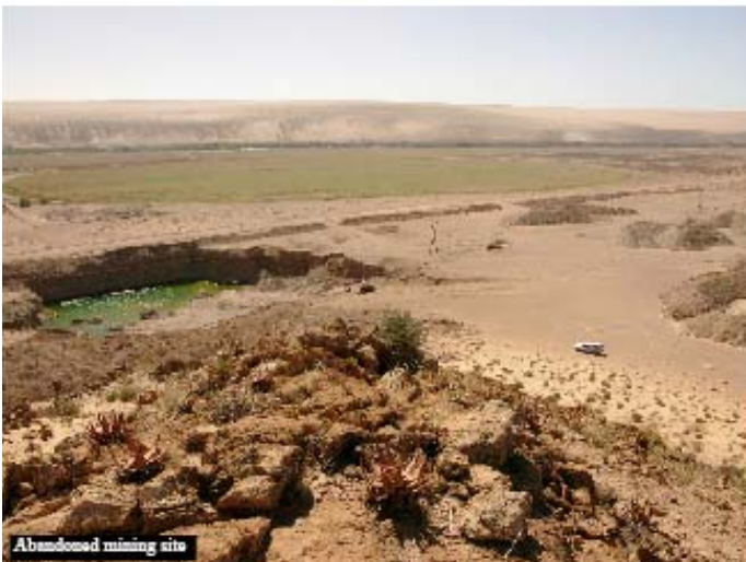
Abandoned mining site