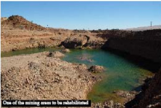
One of the mining areas to be rehabilitated