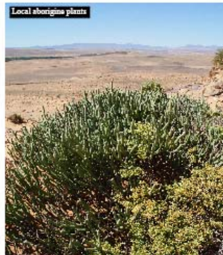
Local aborigine plants