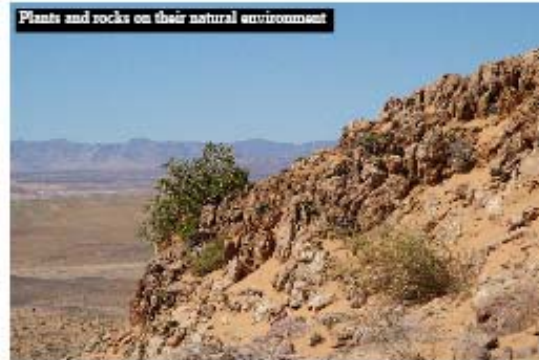
Plants and rocks on their natural environment