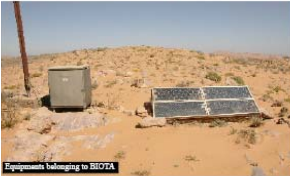
Equipments belonging to BIOTA