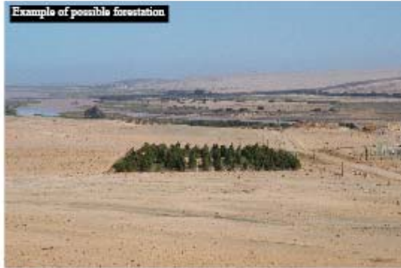
Example of possible forestation