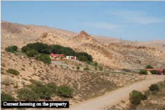
Current housing on the property